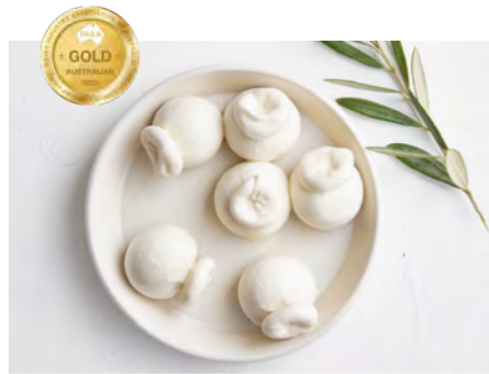
BABY BURRATA 30g Decadent mozzarella filled with stracciatella