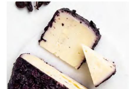
DRUNKEN BUFFALO 80% buffalo milk cheese, matured in Nebbiolo grape skins and must