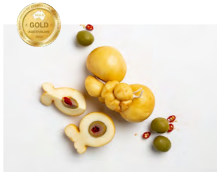
DIAVOLETTI Smoked provolone filled with olive and chilli