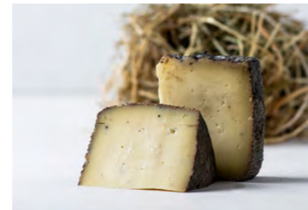
SECRETS OF THE FOREST 80% buffalo milk cheese with black truffles, matured in hay