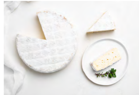
STELLA ALPINA Semi soft alpine-style mould ripened cheese