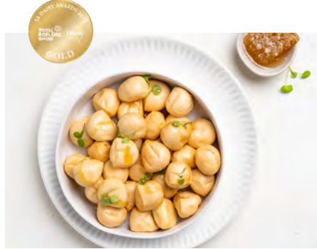
SMOKED BOCCONCINI 10g Bite sized smoked mozzarella