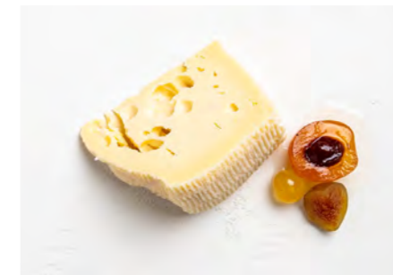
PANETTONE Semi matured cow milk 'eye cheese'