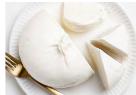
BUFFALO AVERSANA 1Kg Buffalo milk mozzarella