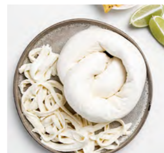
OAXACA String-type Mexican style Mozzarella