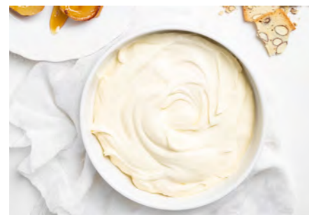
MASCARPONE Italian-style cream cheese