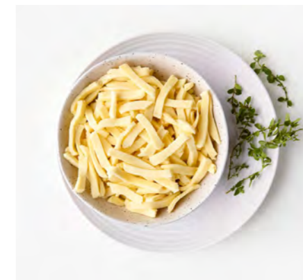
FIOR DI LATTE TAGLIO Julienne cut fior di latte