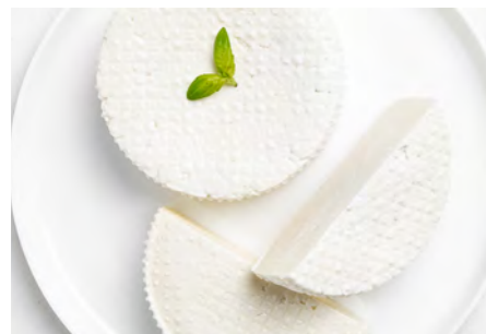
CACIOTTA Fresh cow milk cheese with a semi soft texture