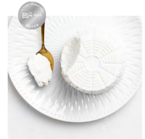
RICOTTA DELICATA Smooth and delicate whey ricotta