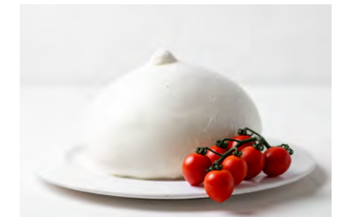
BUFFALO ZIZZONA 3Kg approx Buffalo milk mozzarella