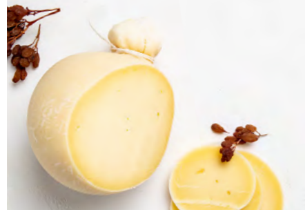
CACIOCAVALLO Traditional aged mozzarella