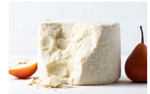
BUFFALOTTO 80% buffalo milk cheese, matured for 12 months