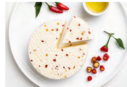
CACIOTTA WITH CHILLI Fresh cow milk cheese with chilli