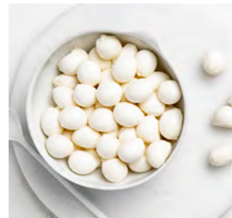
CHERRY BOCCONCINI 10g Cherry sized mozzarella