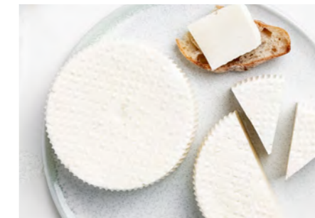
BUFFALO CACIOTTA Fresh buffalo milk cheese with a semi soft texture