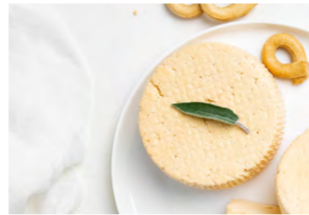
SMOKED CACIOTTA Fresh cow milk cheese, smoked