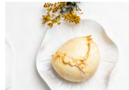
SMOKED BUFFALO MOZZARELLA 125g Beechwood smoked buffalo milk mozzarella