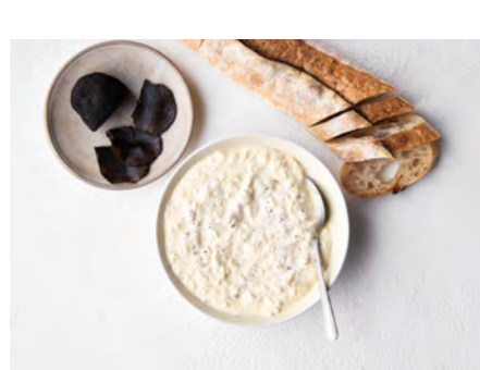
TRUFFLE STRACCIATELLA Mozzarella strips in truffle cream