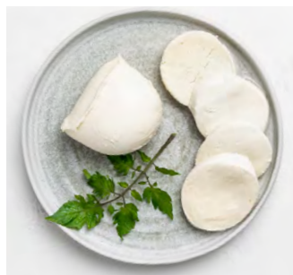
FIOR DI LATTE 125g Plump fresh mozzarella