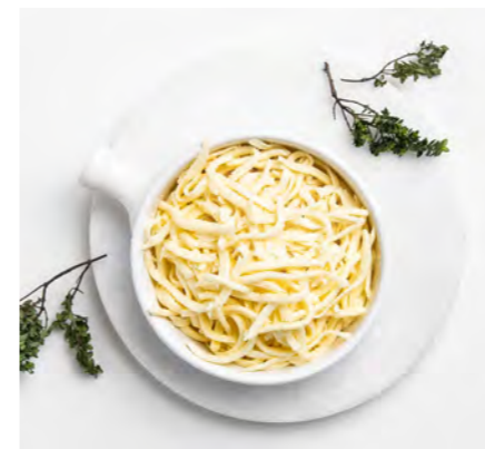
SHREDDED MOZZARELLA Finely shredded mozzarella