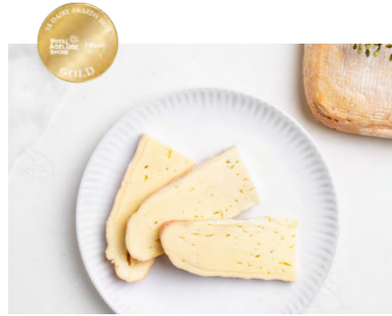
LAVATO Washed rind cow milk cheese (Taleggio style)