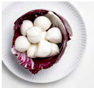
BOCCONCINI 25g Bite sized mozzarella