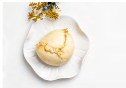
SMOKED BUFFALO MOZZARELLA 125g Beechwood smoked buffalo milk mozzarella