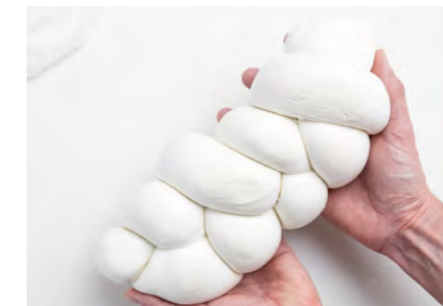
BUFFALO TRECCIA 1Kg or 2Kg Hand braided buffalo milk mozzarella