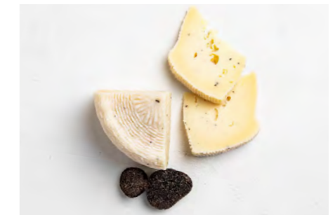
PANETTONE TRUFFLE Semi matured cow milk 'eye cheese' with black truffles