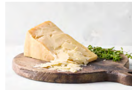
GRANAMORE Italian grana style cheese