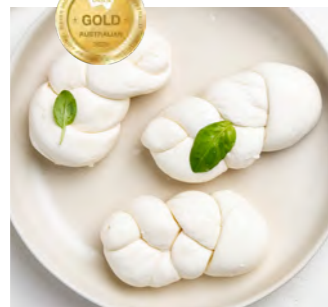
TRECCE 125g Hand braided mozzarella