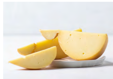
SMOKED CACIOCAVALLO Aged smoked mozzarella