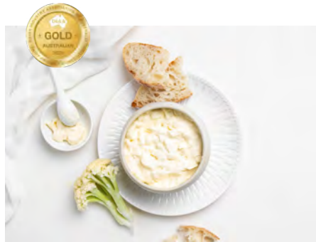
STRACCIATELLA Mozzarella strips in cream (burrata filling)