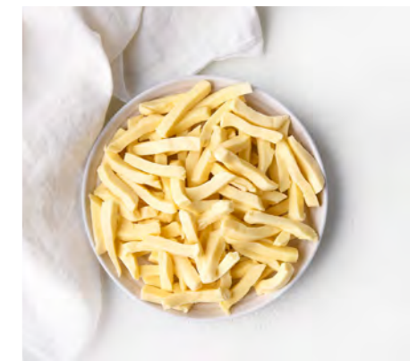
NAPOLI CUT Julienne cut mozzarella