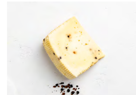
CACIO PEPPER Cow milk cheese with black peppercorns (pecorino style)