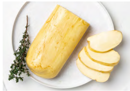
SCAMORZA AFFUMICATA Gourmet smoked mozzarella