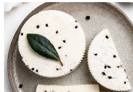
CACIOTTA WITH PEPPER Fresh cow milk cheese with black peppercorns