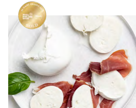
BUFFALO MOZZARELLA 125g Plump ball of buffalo milk mozzarella