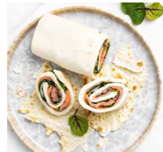
BOCCONCINI LEAF Flat mozzarella sheets, ready to be filled and rolled