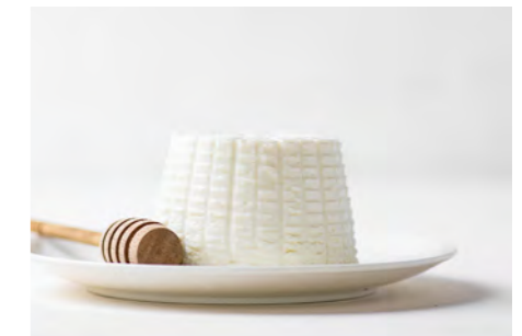
BUFFALO RICOTTA Traditional whey ricotta made from buffalo milk