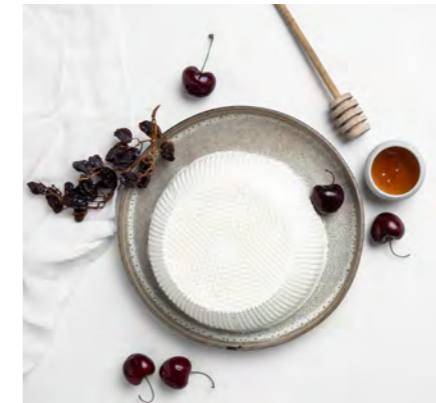
TRADITIONAL RICOTTA Traditional whey ricotta with a soft texture