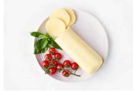
PROVOLONE Mild cow milk provolone log