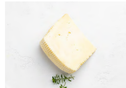
CACIO Cow milk cheese (pecorino style)