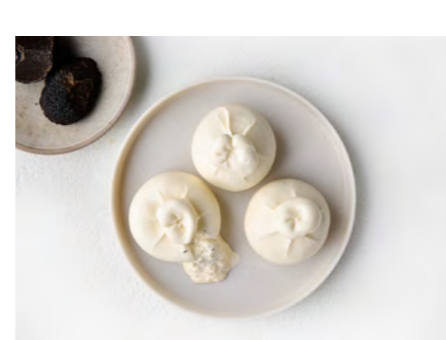
TRUFFLE BURRATA 90g Decadent mozzarella filled with truffle stracciatella