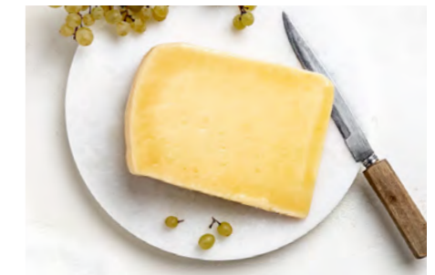
NABUCCO Semi matured cow milk cheese