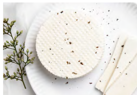
CACIOTTA WITH TRUFFLE Fresh cow milk cheese with black truffles