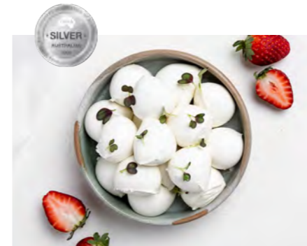
BUFFALO BOCCONCINI 25g Bite size buffalo milk mozzarella