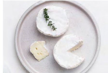
STELLA ALPINA MINI Semi soft alpine-style mould ripened cheese