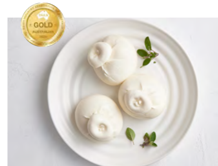
BURRATA 90g/125g Decadent mozzarella filled with stracciatella