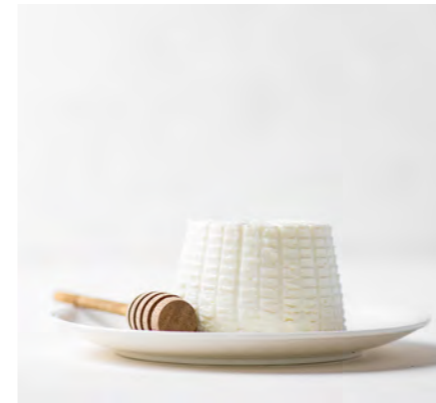
BUFFALO RICOTTA Traditional whey ricotta made from buffalo milk