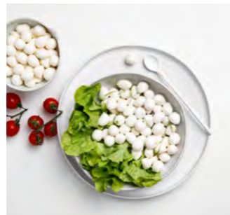
BABY BOCCONCINI 4g Petite sized mozzarella