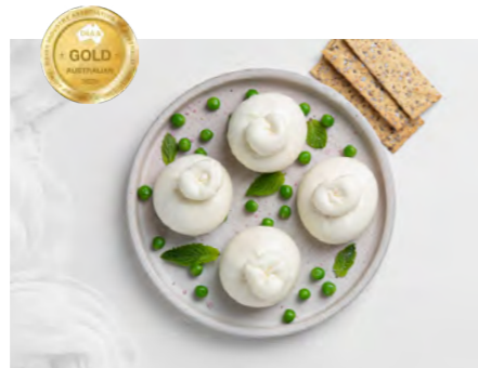
MINI BURRATA 60g Decadent mozzarella filled with stracciatella