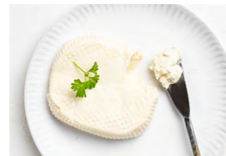
SQUACQUERONE Soft and spreadable cheese (stracchino)