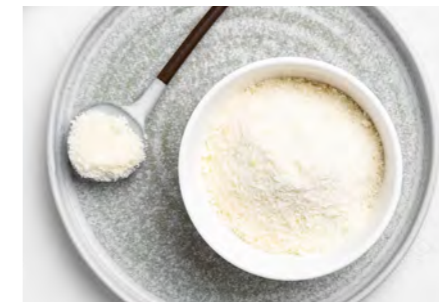
GRATED PARMESAN Finely grated Australian parmesan cheese