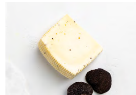
CACIO TRUFFLE Cow milk cheese with black truffles (pecorino style)