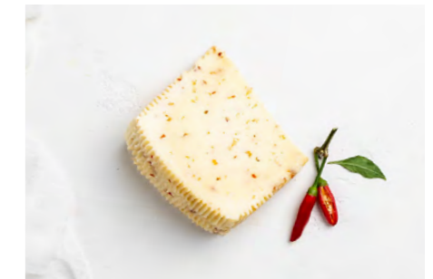
CACIO CHILLI Cow milk cheese with chilli (pecorino style)